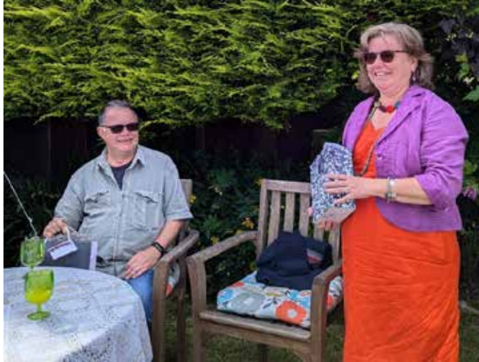
Carharrack Community Choir sing at the Mills & Wakeham Afternoon Tea Mills Hall - July 2024